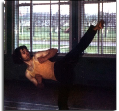
Blue Belt - 1980