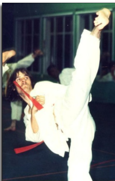
Red Belt - 1981