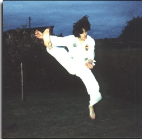
Green Belt - 1980