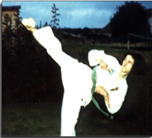
Green Belt - 1980

This little photographic biography is a small selection photographs taken from Grand Master O'Neill's personal album and has been produced to reflect the years of development of your Master Instructor.