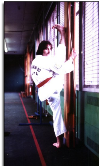
Red Belt - 1981