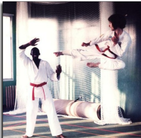
Red Belt - 1982