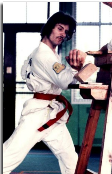
Red Belt - 1982