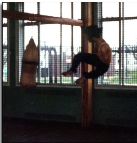
Blue Belt - 1980